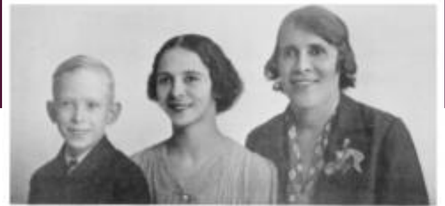
THREE GENERATIONS (Reading from Right to Left)